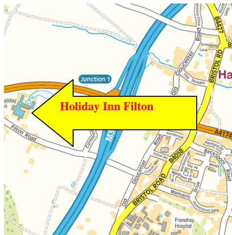
Holiday Inn ,Filton

The blue spot on the map is the exact location of the Holiday Inn, Filton ,Bristol.